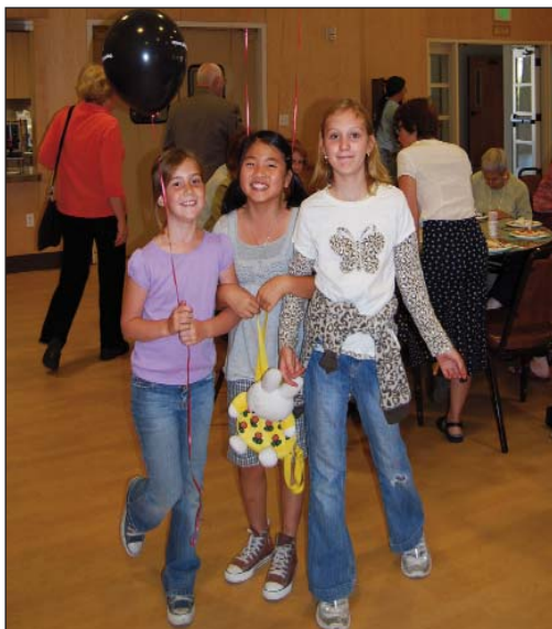
Having a Ball at Last Year's Open House

Sun., Sept. 20 , marks Eden's first E-vent, called Open House Sunday. This day is especially designed to help introduce newcomers to the life and ministry of Eden Church. Please begin planning and inviting friends, neighbors, and extended family to Eden for this very fun Sunday. The E-Team will present all of our visitors and those who bring them with "God is Still Speaking" (GISS) beach balls. Our full-fledged church school program will resume, classrooms will be open for tours, and teachers will be on hand to meet and greet children, youth, and families. The Fellowship Committee will provide a free yummy lunch. And information will be available about Eden Church programs offered in the coming year.