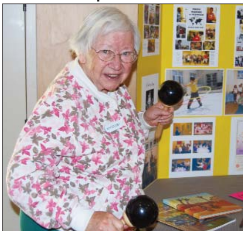
Feeling the Beat at Eden