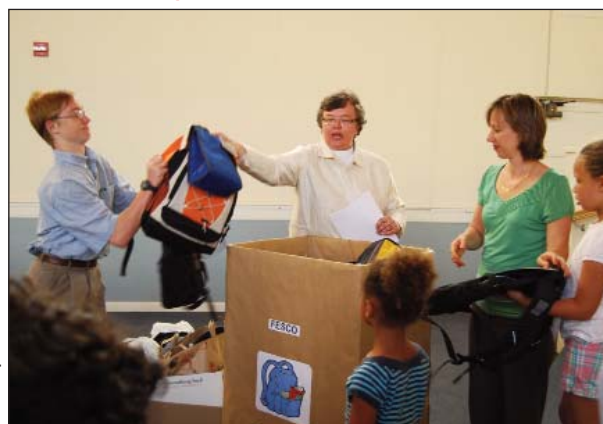
Getting Ready to Bless the Backpacks