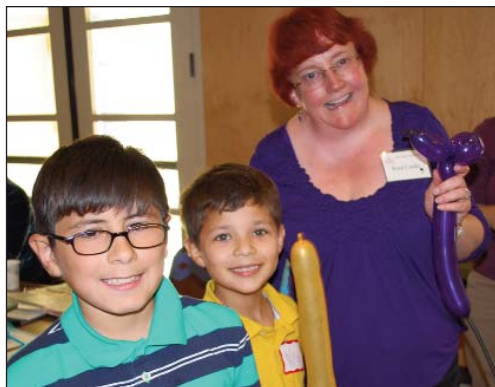
Fellowship Team Makes Balloon Animals on Homecoming Sunday