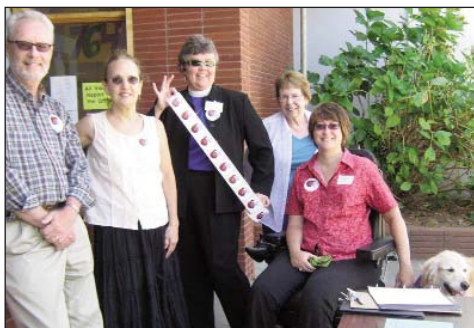
Cherryland Elementary Volunteers