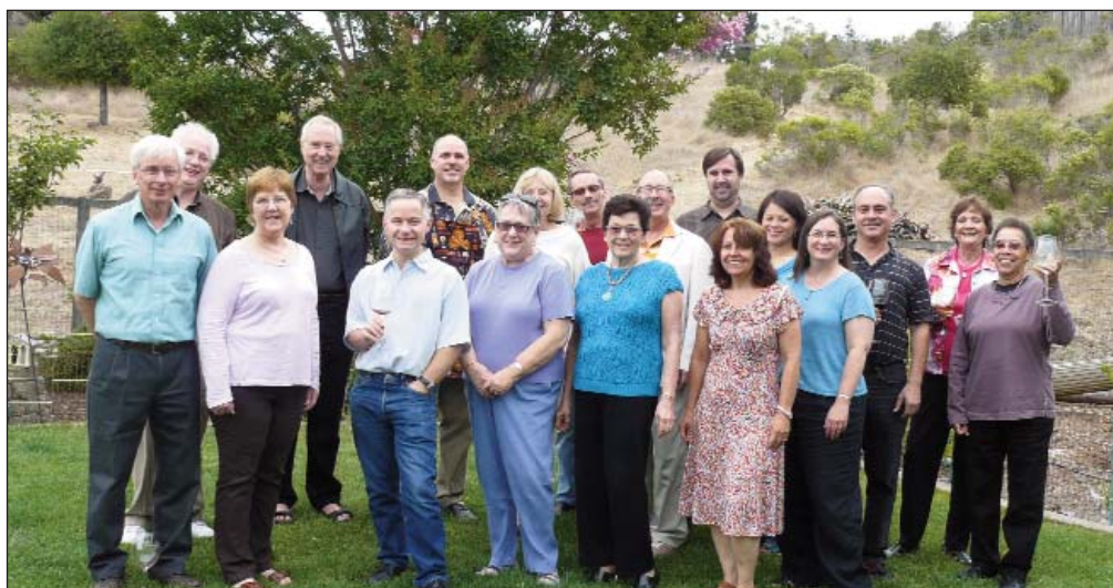
Celebrating Fall in Style at Stuber Residence.