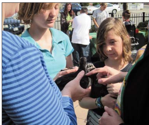
Blessing the Chickens