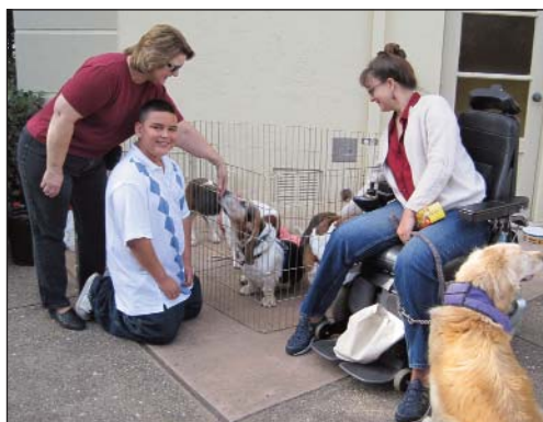
Blessing the Dogs