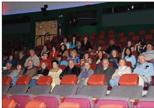
Eden at the Planetarium