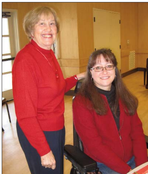
Friends Share a Moment