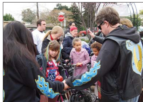
Blessing the Kids Bikes

During these difficult economic times let's remember to continue our spirit of giving by contributing to the monthly FESCO (The Family Emergency Shelter Coalition) collection. On the first Sunday of the month please bring your non-perishable household goods to the church, including items such as toilet paper, bleach, canned soup, and juice. A full list of items to donate can be found in the church office. Our next donation date will be Sunday, March 1 .