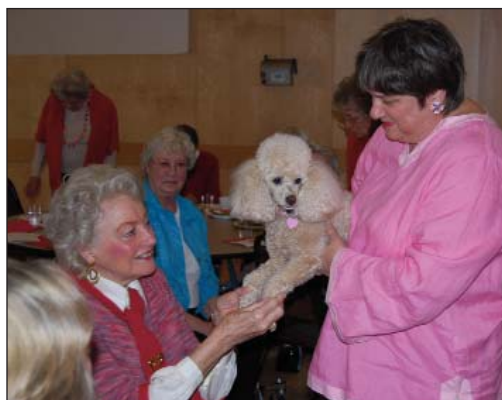
Ginger Meets and Greets