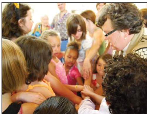
Blessing Jubilee Member Pins

Then on Sunday, June 28, the congregation recognized the Jubilee members by presenting them with golden pins blessed with a special prayer by the tiniest hands. “Making new friends and keeping the old.”