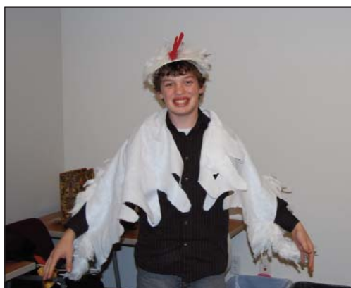
A Rooster for the Manager