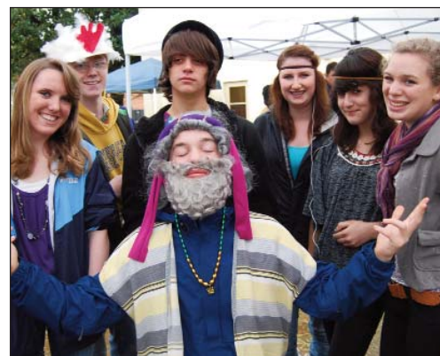
Cast of Characters