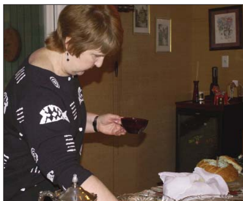
Time for Tea