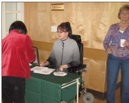
Santa's Helpers at FESCO Luncheon