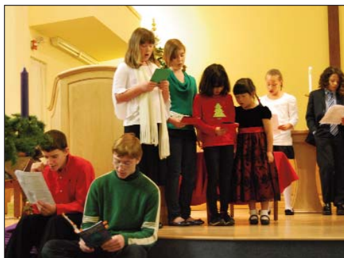
Caroling in the Pageant