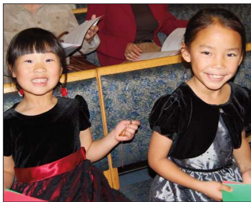
Ready for the Pageant