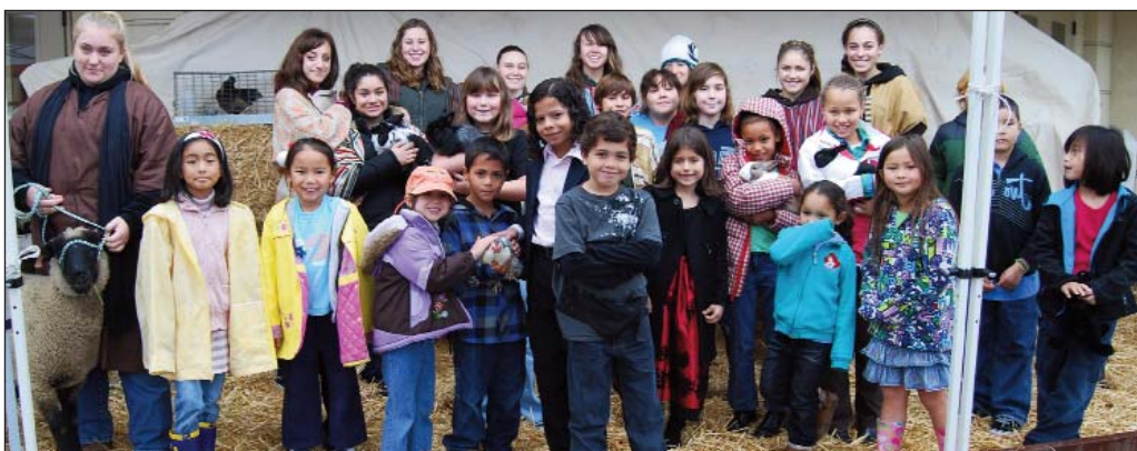
Special Children's Time with 4-H Club