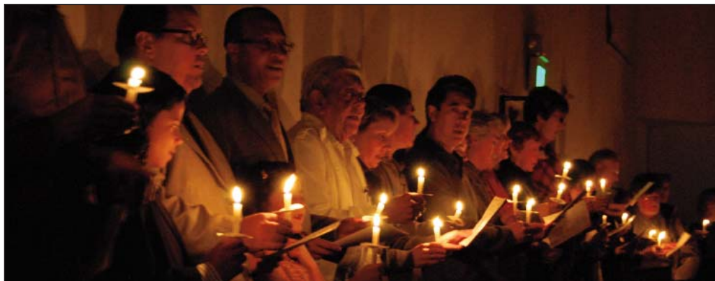
Congregation Sings Silent Night