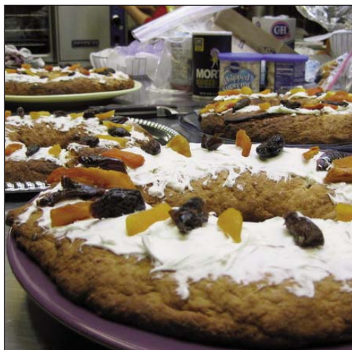
A Feast Fit For a King