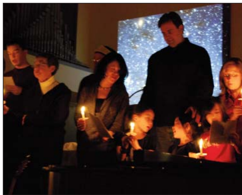
Families Join the Caroling