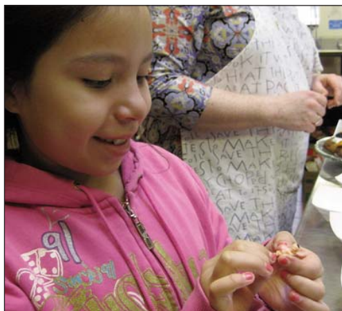
Three Kings Day