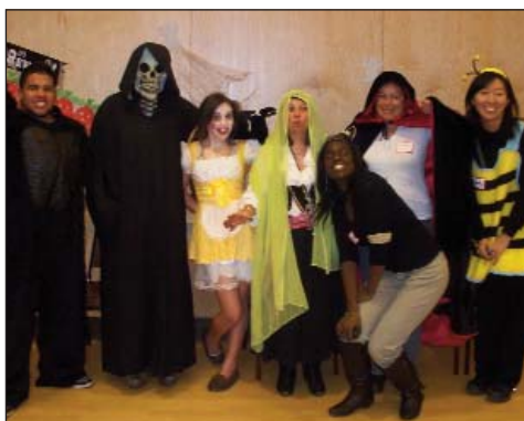
"Holyween" Cast of Characters