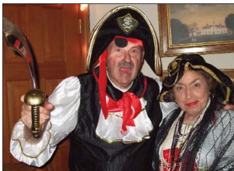
Hunting for Treasure on Halloween