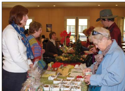
Treats Sell Quickly at Bazaar