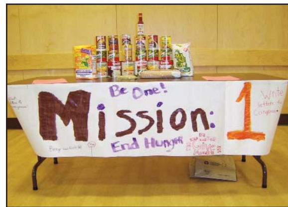
Mission: 1 is Number One