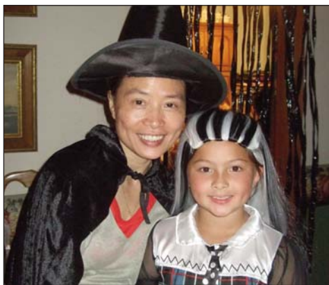
Mother and Daughter in Costume