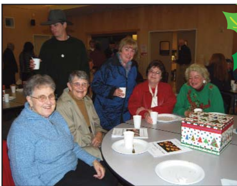
Enjoying Christmas Cookies