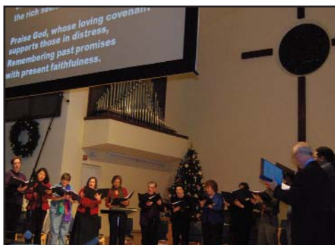
My Soul Gives Glory