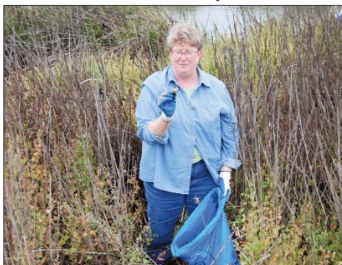
What Have We Here?

of your invited guests. Let's make this our biggest Spirit-in-Action event again this year!