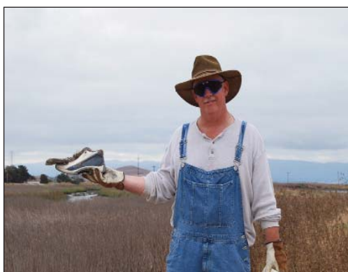
Volunteers Clean Up in 2008

All equipment, tools, gloves, and instructions are provided. No experience necessary! Please bring a hat and a light jacket; long pants are recommended, as is sunscreen. Wear closed-toed shoes to protect your feet. Bring your own water bottle, but water and granola bars will be provided. Binoculars and cameras are allowed as long as you take responsibility for them. Volunteers must be able to work the full three hours. Parents are expected to maintain responsibility for their children. While all sites have been scouted to ensure there are no hazards or unsafe conditions, Save the Bay leaders are certified in wilderness first aid and CPR and carry a first aid kit and cell phone in case of emergency. To join the fun and help Save the Bay and the Pacific Ocean, sign up now with Jacque Blake in Oliver Hall after worship, or send her an e-mail at prima_diva@comcast.net. Be sure to include the name, e-mail, and phone number for each participant including any