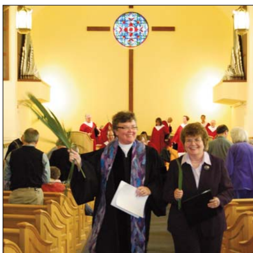
A Palm Parade