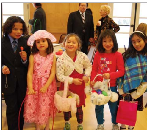
Enjoying Easter at Eden