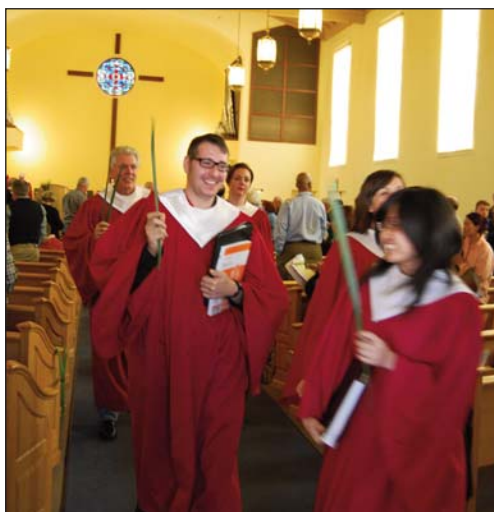
Festive Choir Members